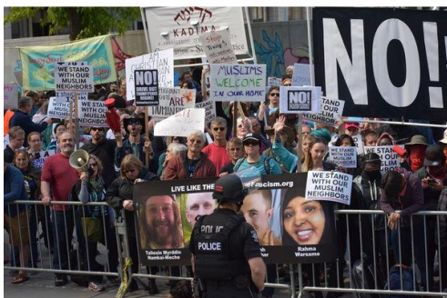
FB Photo speech.

On June 10, 2017, ACT for America, a counterterrorism organization opposed to the implementation of Sharia law within the United States, organized anti-Sharia marches in 28 cities across the country. The marches were promoted extensively on the Internet. Communist front organizations such as the Southern Poverty Law Center and other George Soros funded Communist organizations, organized counter demonstrations. The Communists, far left Unions and anarchists were successful in shouting down and turning otherwise peaceful demonstrations into scenes of violence. Violence turned particularly ugly in Marxist strongholds like New York, St. Paul and Seattle. The anti-Sharia demonstrators were greatly outnumbered. The use of bullhorns, cowbells and drums were used to repress free